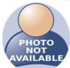
DABADRITA BHATTACHARYA AIR 6 - IITJAM 2013 BIOTECHNOLOGY