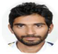
KAUSHAL AIR 10 - IITJAM 2016 BIOTECHNOLOGY